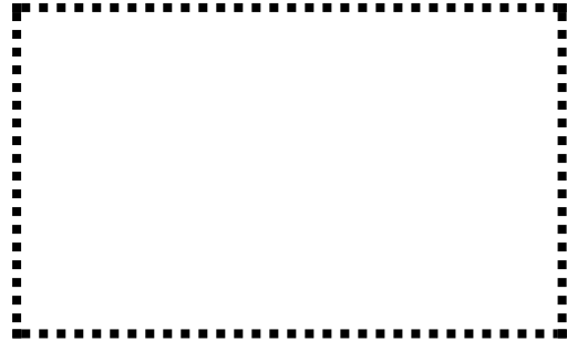
Fig. 6. Potential monuments and converted into a leisure complex